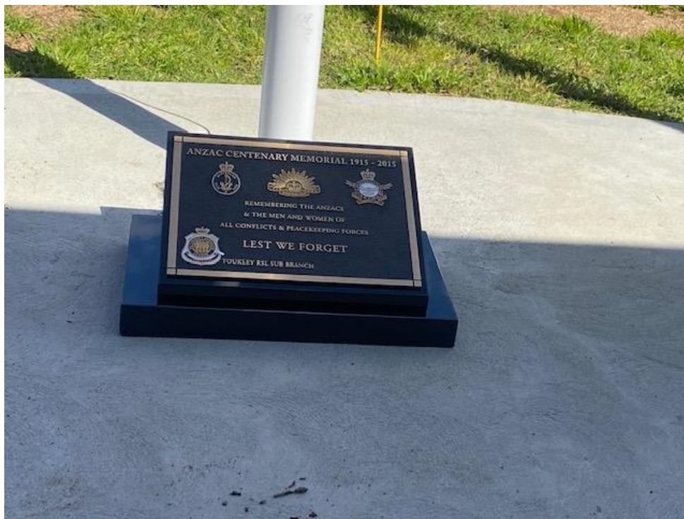
The Anzac Commemoration Plaque At Porters Creek Public School

The Anzac Commemorative plaque provided by the Sub Branch is now in place at the flagpoles at Porters Creek Public School. The school is very grateful to the Sub Branch for this new plaque.