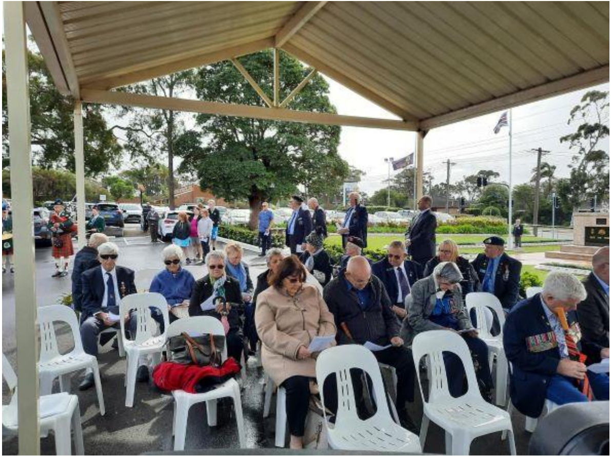
Members and public at memorial service for Queen Elizabeth 11