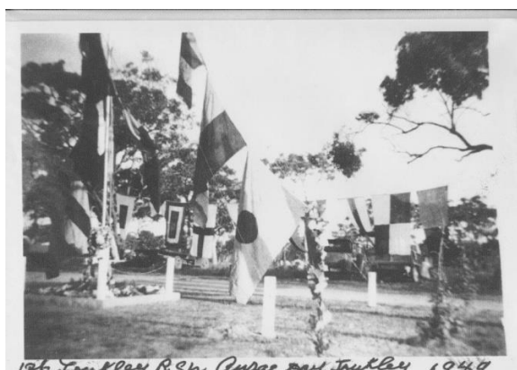
1st Toukley RSL Anzac Day Toukley 1949