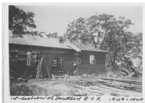
1st section of Toukley RSL 1948-1949

On 24 October 1949, the Sub Branch purchased the old Wyong Bakehouse for one hundred and four pounds, five shillings and with voluntary labour, reconstructed the building with suitable additions which, when finished, was a double frontage weatherboard building on land purchased where the present main entrance to the Club is now. A new brick building was erected in 1963 and named the Toukley RSL Sub Branch Club.