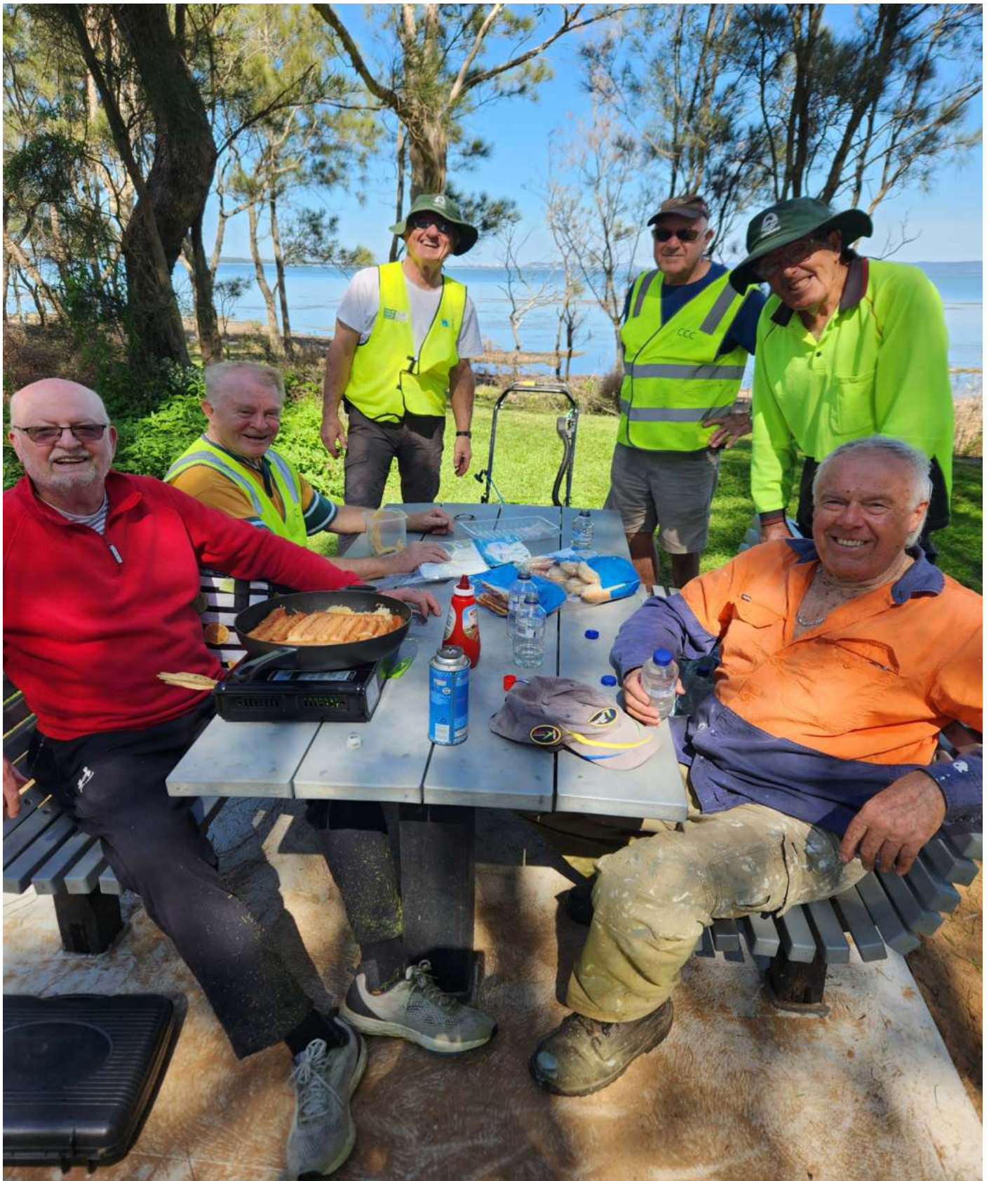
Photo of the working group taken at Vietnam Veterans Park at Gorokan.

More volunteers welcome. Next working bee on Wednesday 4 October then every two weeks. Any assistance would be appreciated. Please see ad on previous page for more details.