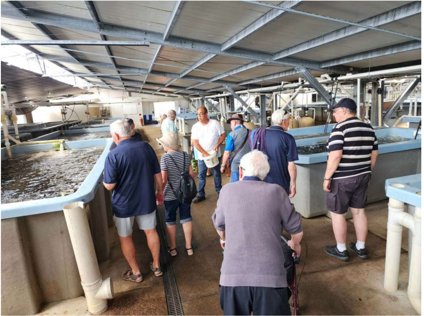
Two photos above taken at Barramundi Fish farm