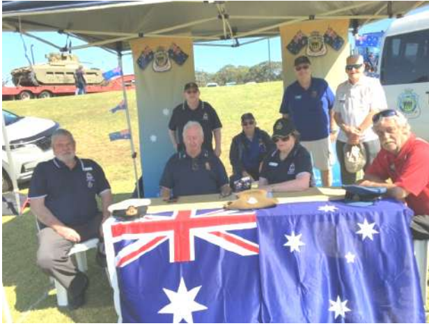
Some of our Members on hand