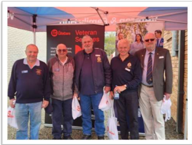
Toukley RSL Sub Branch Representatives