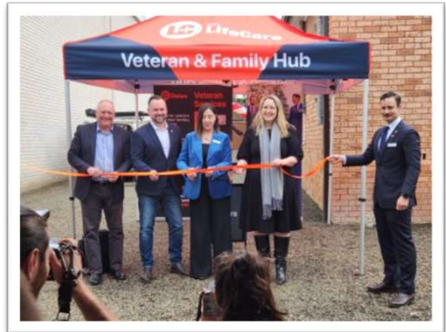
Dignitaries cutting the ribbon