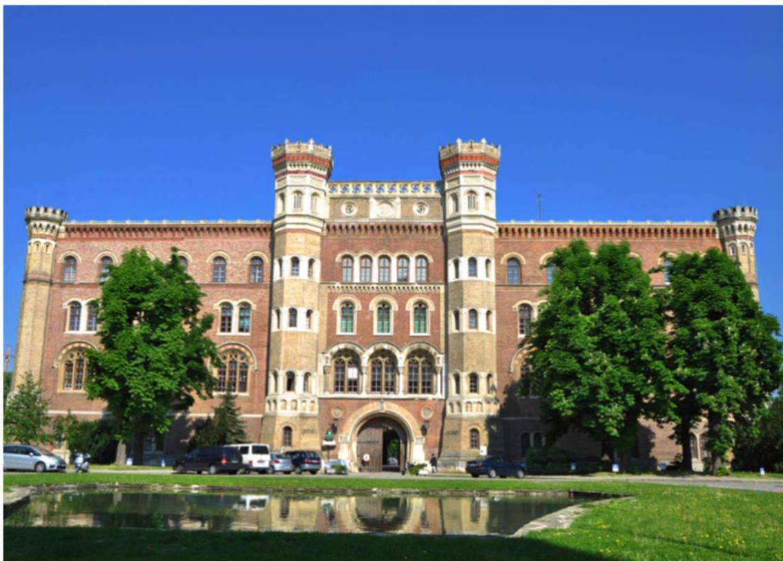
Museum of Military History, Vienna